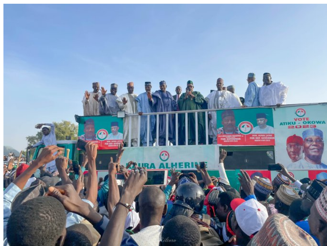
The governor and hi team during the campaign at Gamawas