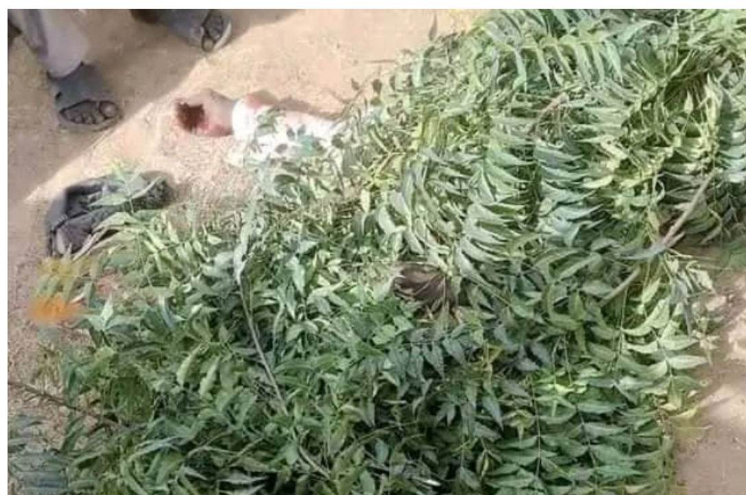
The deceased persons covered with leaves